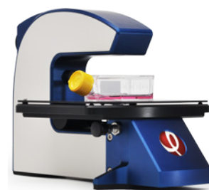
HoloMonitor M4 – a holographic time-lapse cytometer

For analysis using the HoloMonitor M4 cells were seeded into a T-25 flask and imaged at 5 minute intervals for 24 hrs. The drug co-loaded liposomes (LP (XR,PCT)) were then added at the required concentrations, and imaging was continued at 5 minute intervals for 48 hrs.